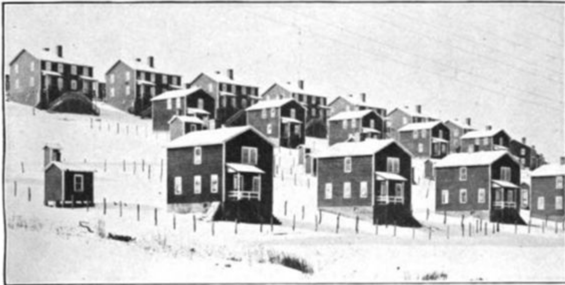
FIG. 18.—GROUP OF HOUSES IN BITUMINOUS COAL REGION OF PENNSYLVANIA.

401 Mate Street Matewan, West Virginia 25678